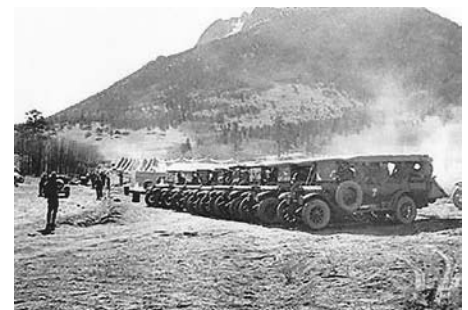
CCC Workers at Rocky Mountain National Park