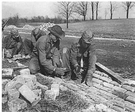
CCC Workers Constructing Road

The author and his wife raised their three children in an old farm house on the West Branch of the Delaware River in Delhi, New York. He taught reading for thirty-six years before retiring and has written books on the Catskill and Adirondack fire towers. He also writes a weekly newspaper column “Adirondack Stories”; 150 of these stories are now in book form.